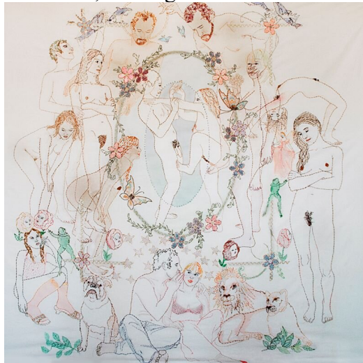
“Nature’s Secret,” hand-stitched embroidery and paint on vintage linen - 80in x 83in

There is a sex-positive feminist imagery running rampant in this piece where polar bears pleasure women and small nudes frolic in nature, using outsized penises as playthings or adornments. It looks at the world like a children's book centerfold. The central figure is smoking (much like the caterpillar was in the original story), while there is a girl child Alice straining to see over a tabletop precipice separating her from adult pleasures. The drawings snap to 2D from a certain distance, but, upon closer examination, one begins to see wrinkles and thread textures.