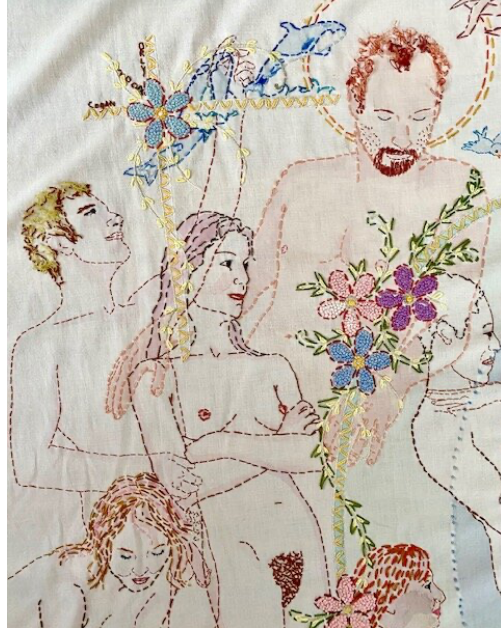
“Nature’s Secret” (details)