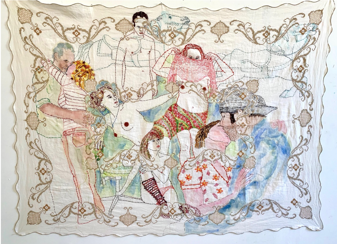
Afternoon Lovin', 2019, 44IN x 56IN

HOUSE OF THEODORA CHATS TO ARTIST ORLY COGAN