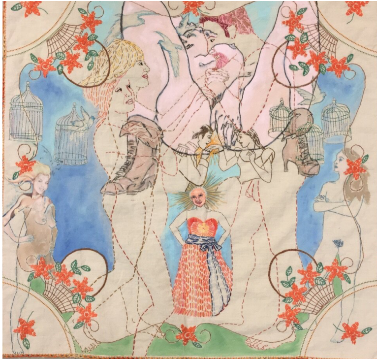
Schieles Flower Basket